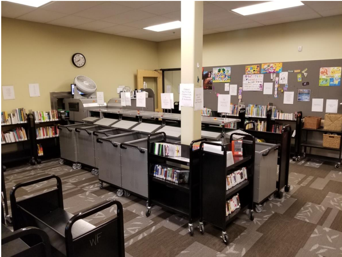
Images and floorplan of current AMH system at Anythink Wright Farms