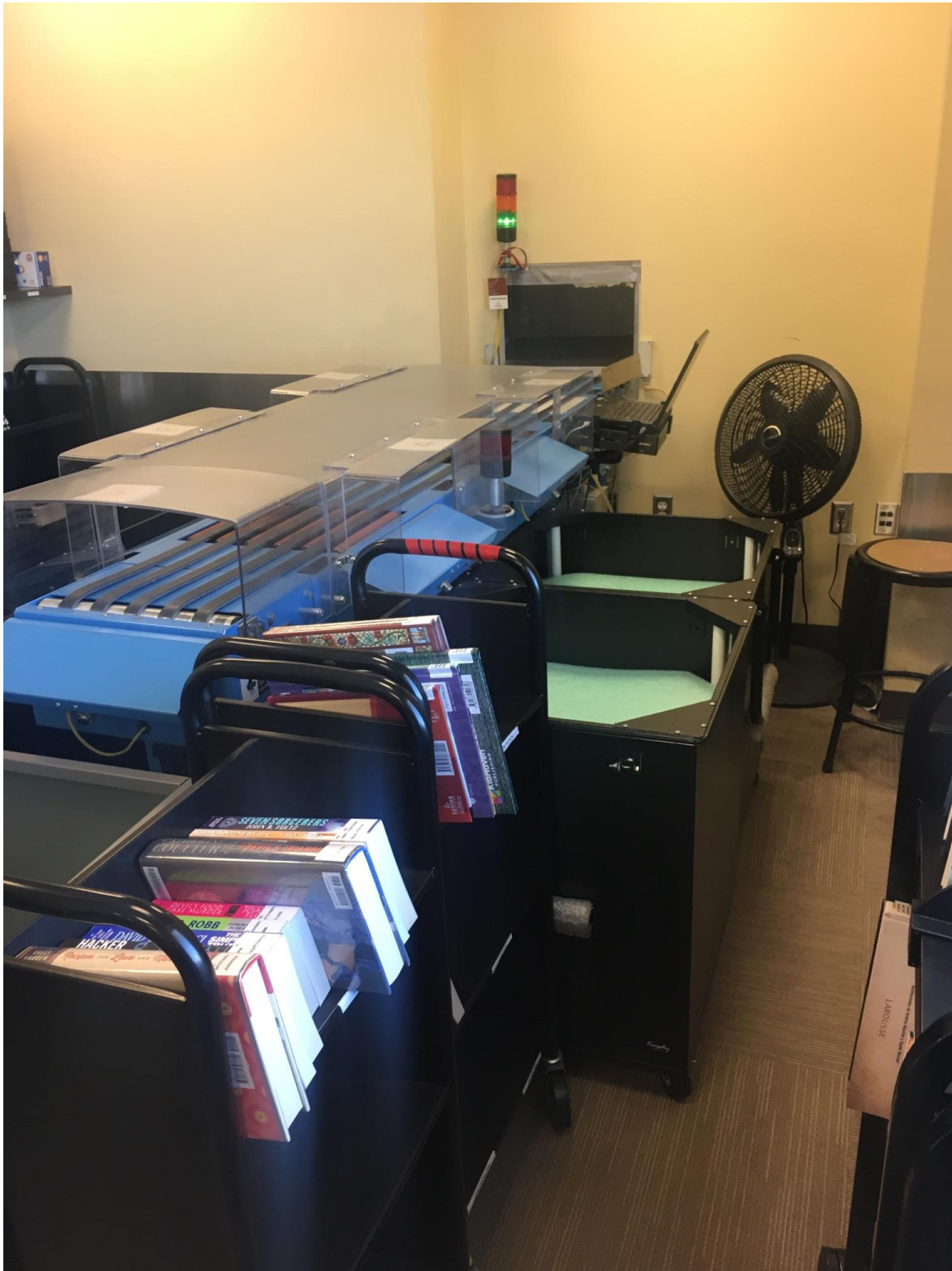
Images and floorplan of current AMH system at Anythink Brighton