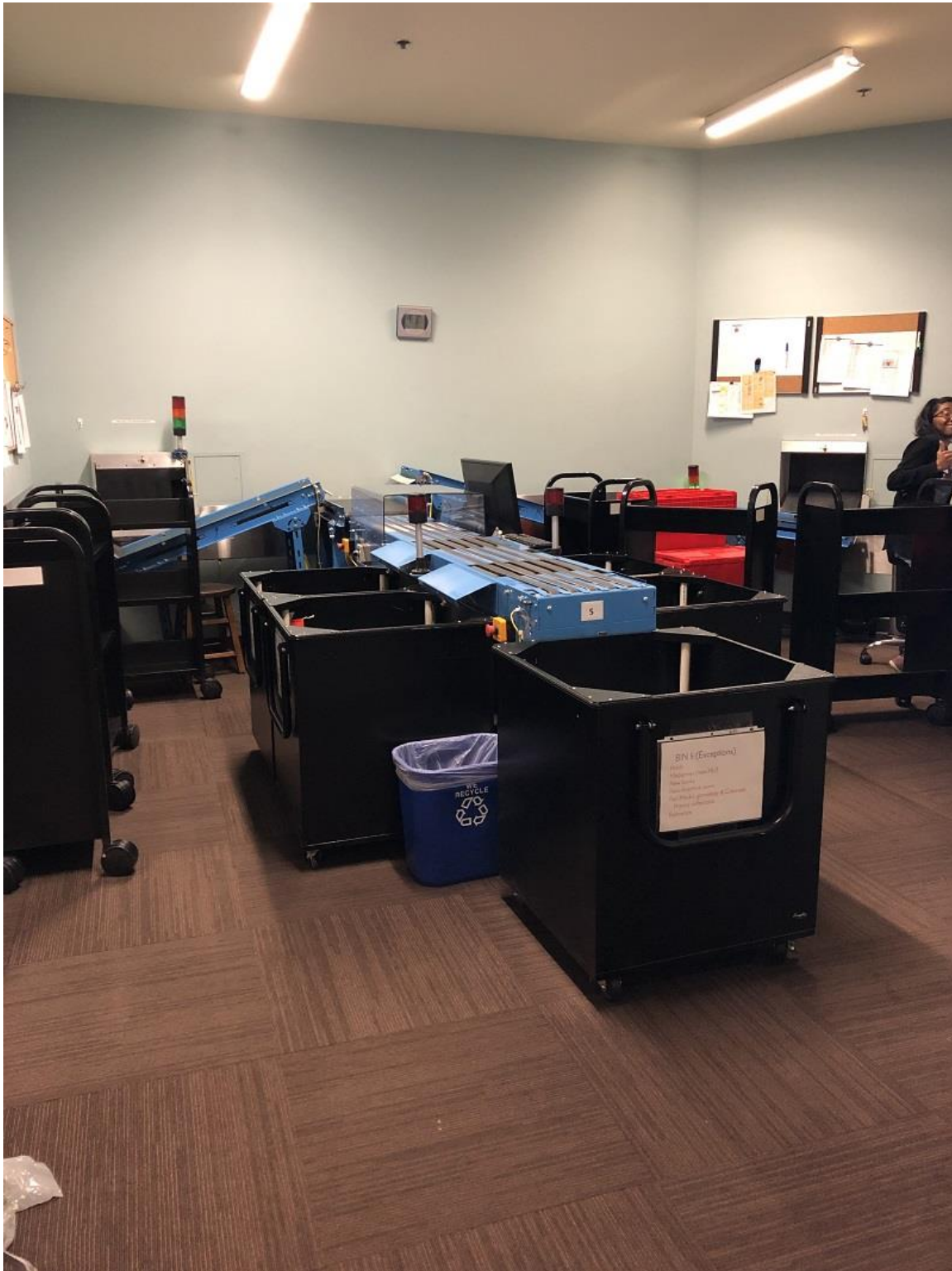
Images and floorplan of current AMH system at Anythink Huron Street